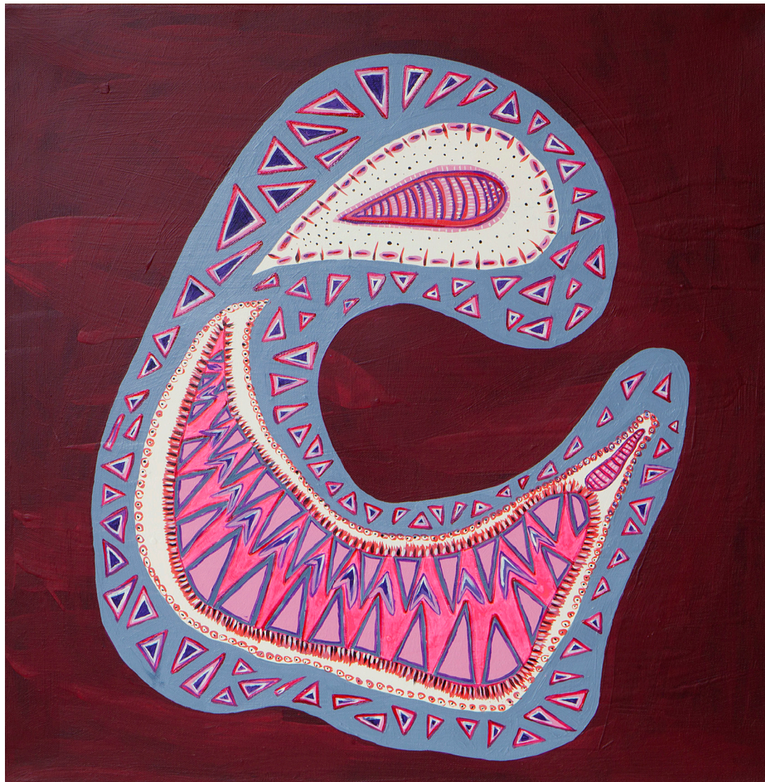
Deborah Weber Well Being, 2023 Acrylic on canvas 60 x 60 x 4 cm R8 480 (inc VAT)