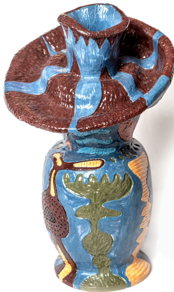
Deborah Weber Organism flora 1, 2022 Ceramics 19 x 32 cm R6 360 (inc VAT)