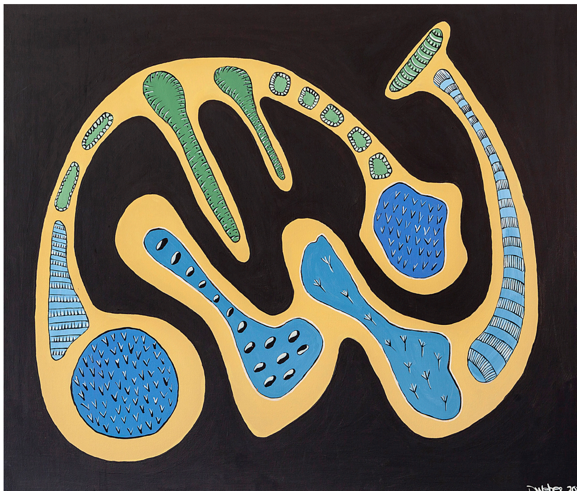
Deborah Weber Intertwined , 2022 Acrylic on canvas 101 x 76 x 2 cm R14 840 (inc VAT)