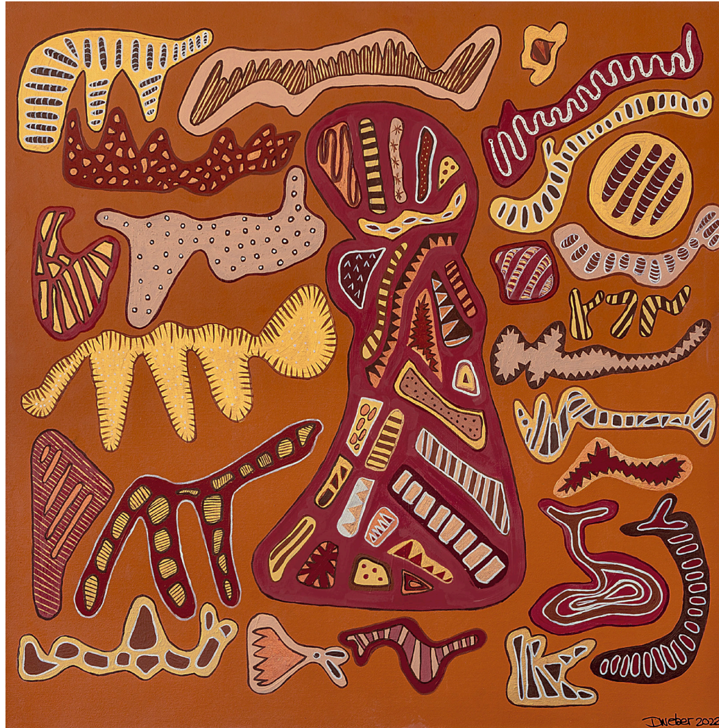
Deborah Weber Community , 2022 Acrylic on canvas 91 x 91 x 4 cm R14 840 (inc VAT)