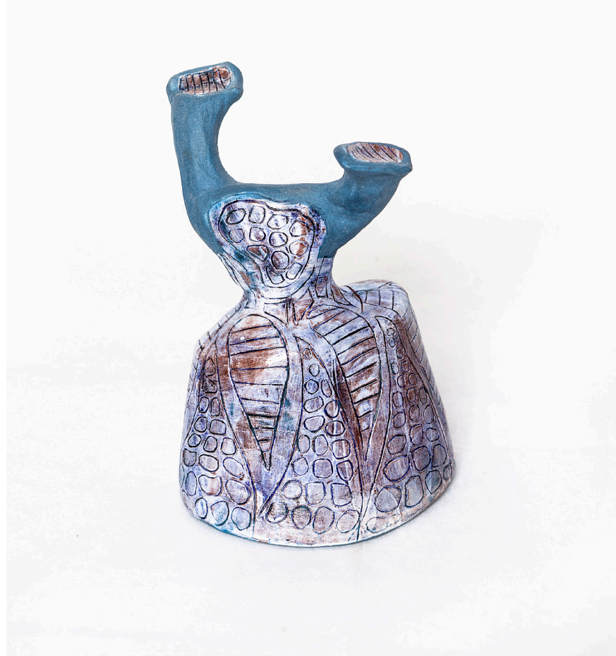
Deborah Weber Organism fauna 1, 2022 Ceramics 13.5 x 17.5 cm R4 240 (inc VAT)