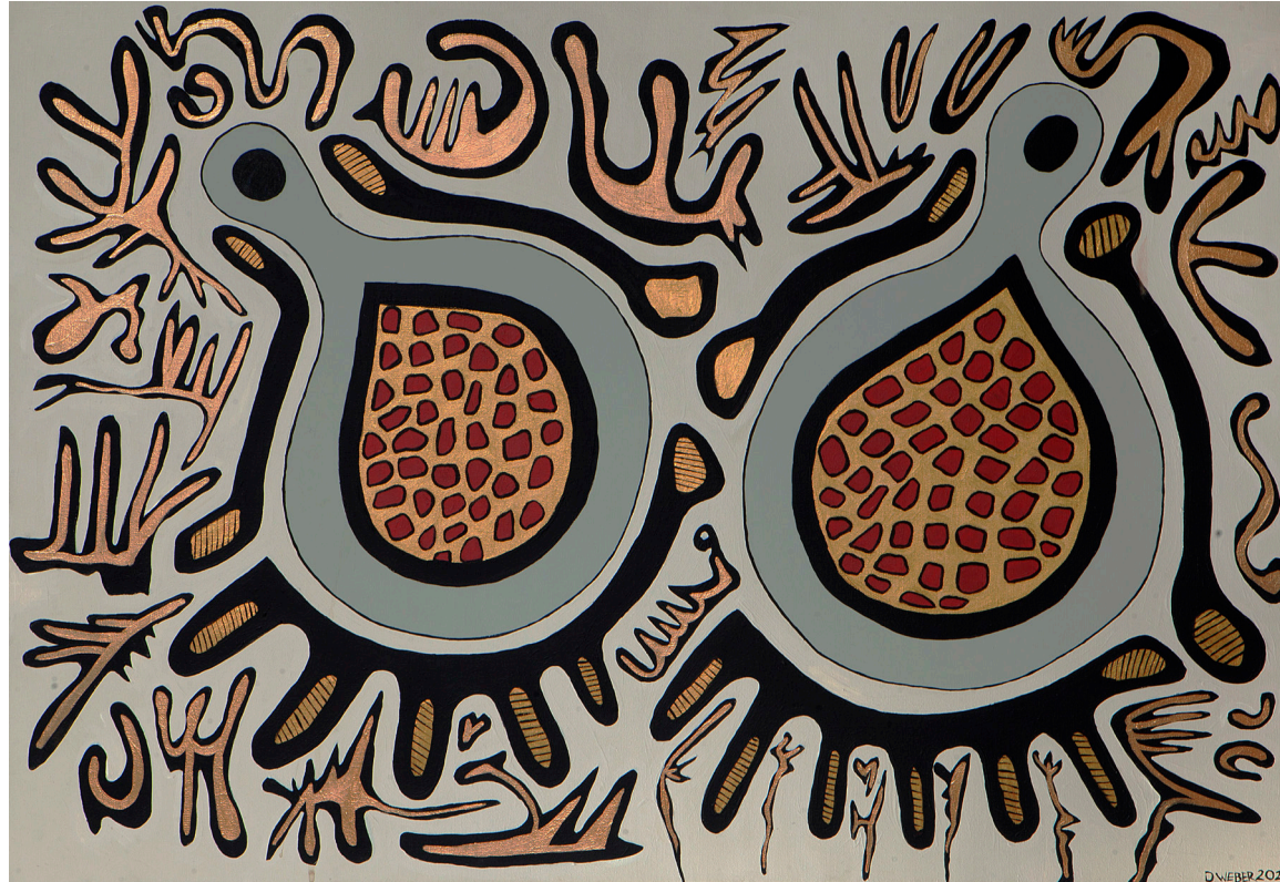
Deborah Weber Mirror , 2023 Acrylic on canvas 100 x 70 x 2 cm R14 840 (inc VAT)