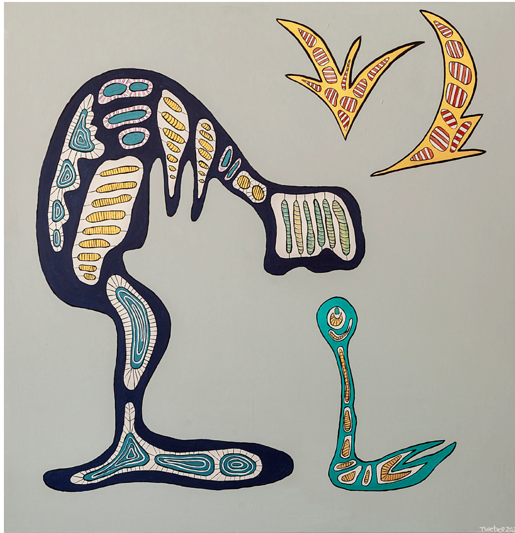
Deborah Weber Follow Me , 2021 Acrylic on canvas 101 x 101 x 2 cm R16 960 (inc VAT)