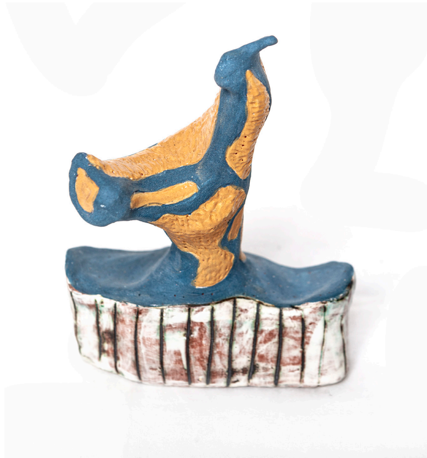
Deborah Weber Organism fauna 2, 2022 Ceramics 12 x 15 cm R3 180 (inc VAT)