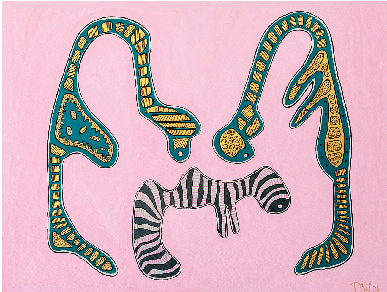
Deborah Weber Parenting , 2021 Acrylic on canvas 101 x 76 x 2 cm R14 840 (inc VAT)