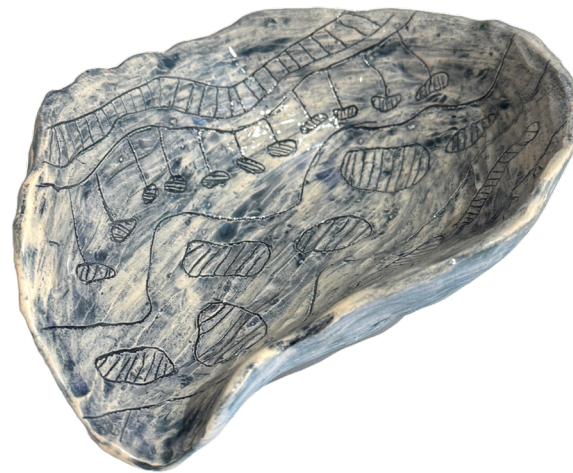
Deborah Weber Container , 2023 Ceramics 18 x 13 x 7 cm R2 120 (inc VAT)