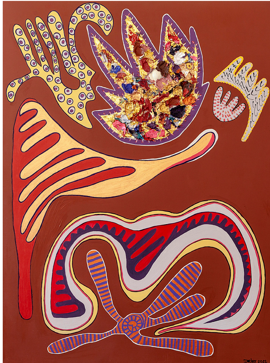
Deborah Weber Motherhood , 2022 Acrylic on canvas 122 x 92 x 4cm R21 200 (inc VAT)