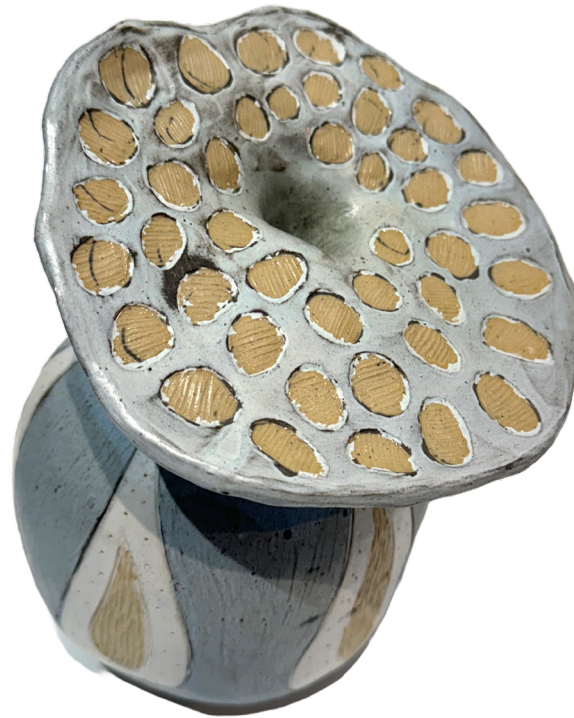
Deborah Weber Organism fauna 3 , 2023 Ceramics 14 x 19.5 cm R4 240 (inc VAT)