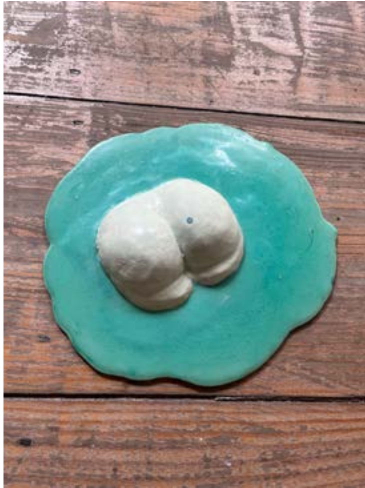
Gabriele Jacobs Bottoms up , 2023 Material 1 and slipcast ceramic R2332