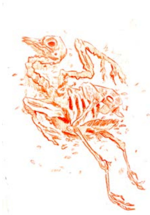
Amber Alcock Death Study #2, 2023 Sketch on paper (Framed) A4 R2120