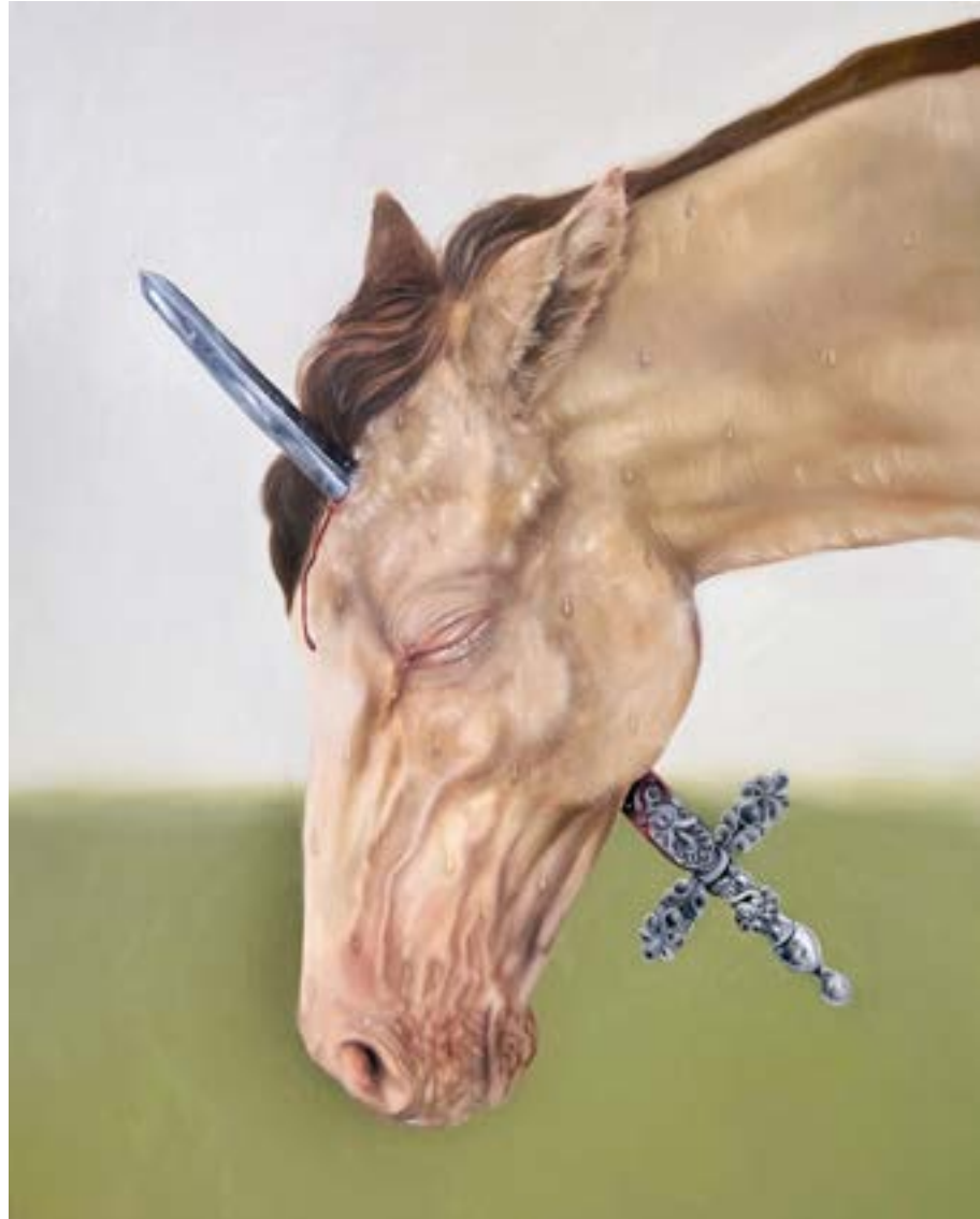
Amber Alcock Femininity , 2023 Oil on canvas 100 x 127 cm R12720