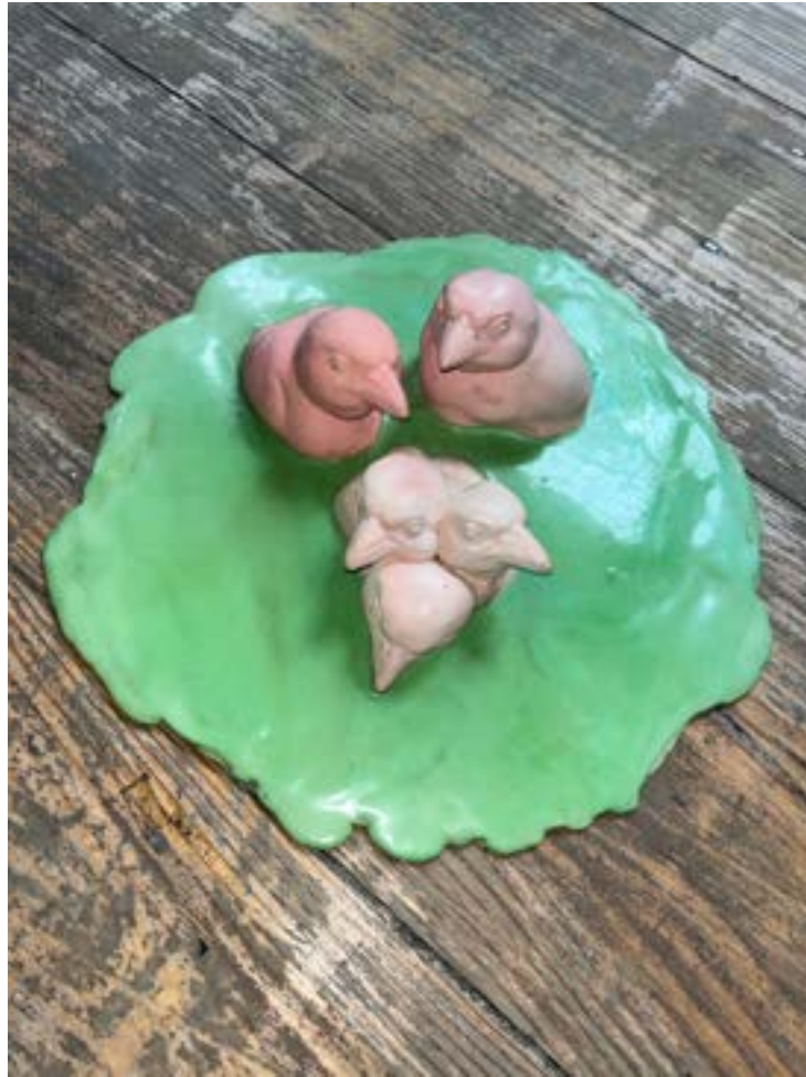
Gabriele Jacobs It takes all sorts , 2023 Material 1 and slipcast ceramic R4240