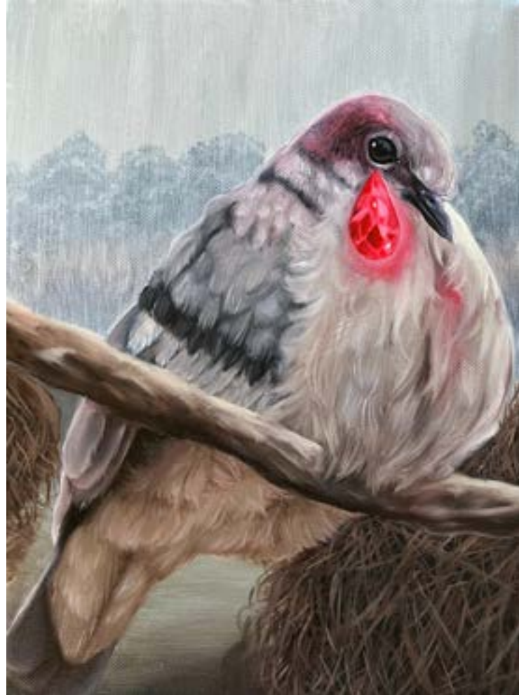
Amber Alcock Bleeding Heart Dove #1, 2023 Oil on Canvas A4 R4770