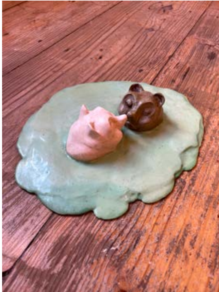
Gabriele Jacobs Cuddle puddle , 2023 Material 1 and slipcast ceramic R4240