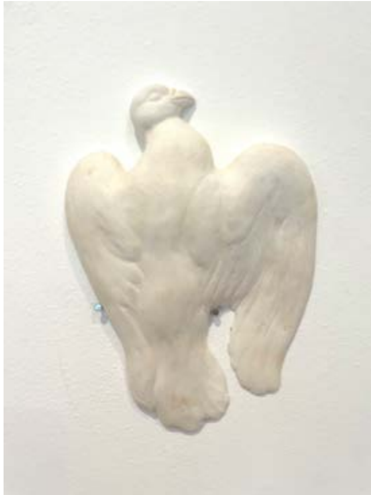
Gabriele Jacobs Fallen II , 2023 Plater of Paris (1 of 10) R2332