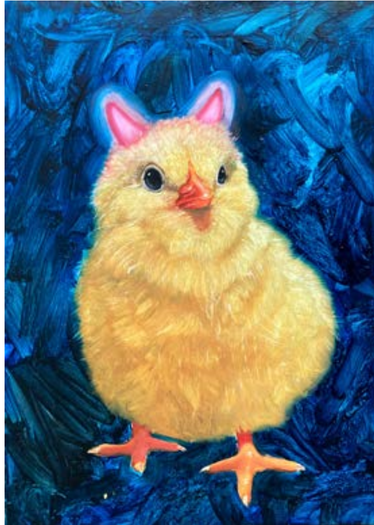
Amber Alcock Fiend #2, 2023 Oil on board A4 R3710