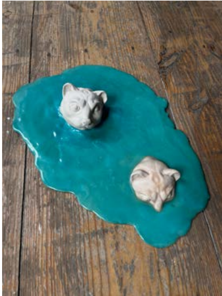
Gabriele Jacobs Puddle Cats , 2023 Material 1 and slipcast ceramic R4240