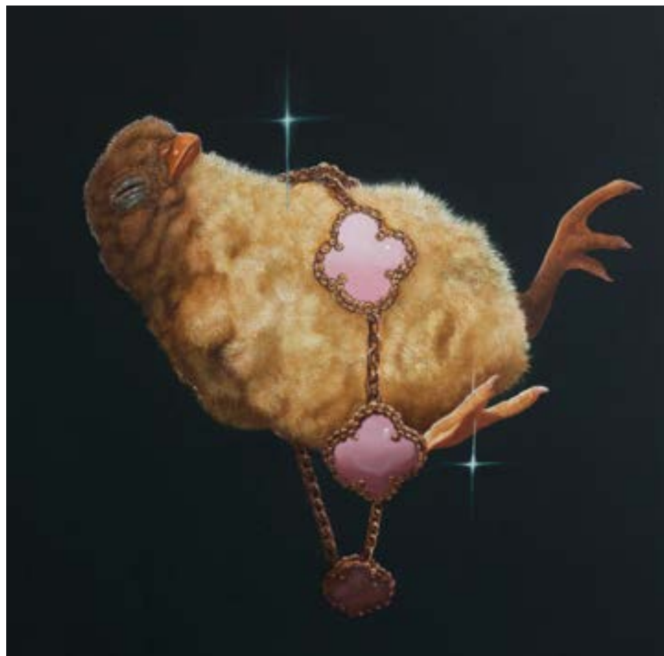
Amber Alcock Exalted , 2023 Oil on board 50 x 50 cm R7420