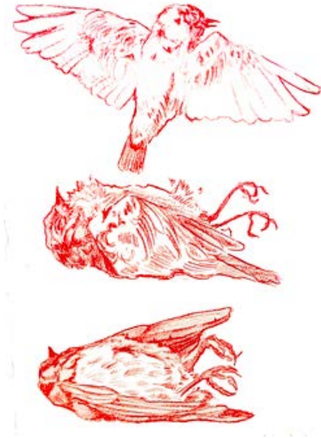
Amber Alcock Death Study #1, 2023 Sketch on paper (Framed) A4 R2120