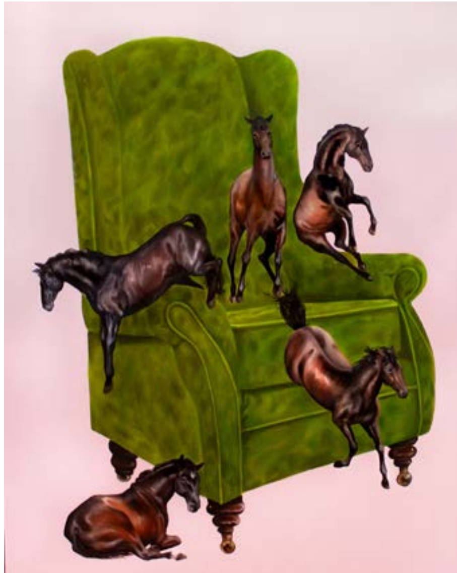
Amber Alcock 'The domestic' , 2023 Oil on Canvas 100 x 120 cm R12720