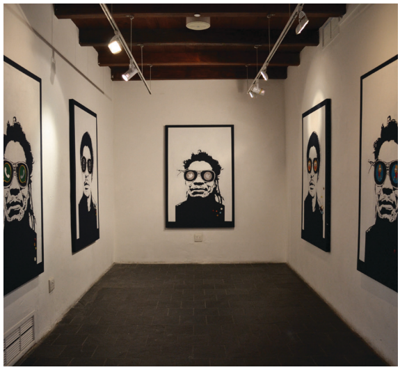
Pixels of Ubuntu (AVA, 2016), Zimbabwe Pavilion at Venice Biennale 2015