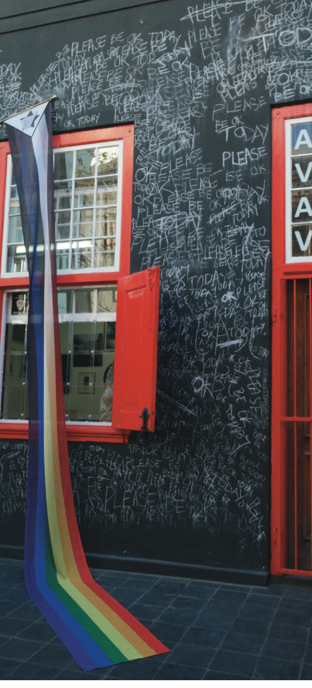
Please be okay today, a mural & performance by Brett Charles Seiler & Luvuyo Nyawose, 2017