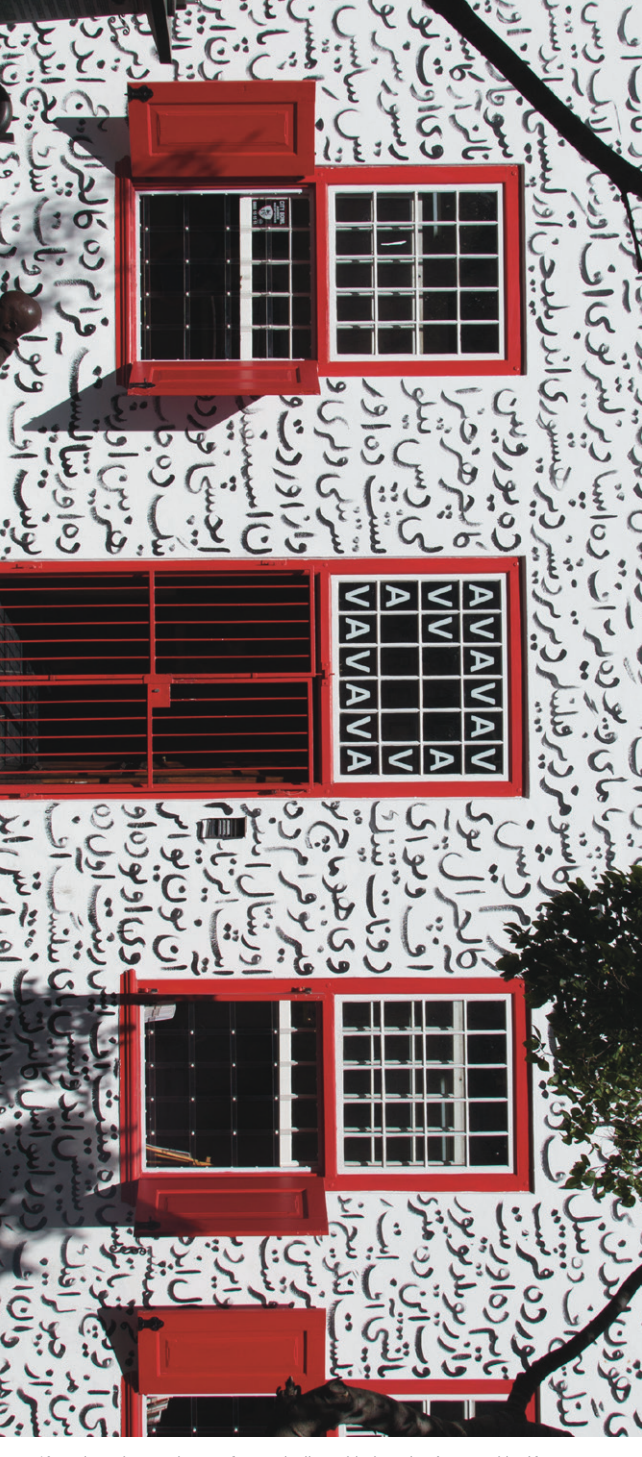
'An exhaustive catalogue of texts dealing with the orient', a mural by Kamyar Bineshtarigh, 2019