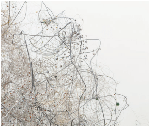
Igshaan Adams, Cloud III detail, wire, beads and mixed media, 2019

that every winter we publish an open call for exhibitions by professional artists and curators?