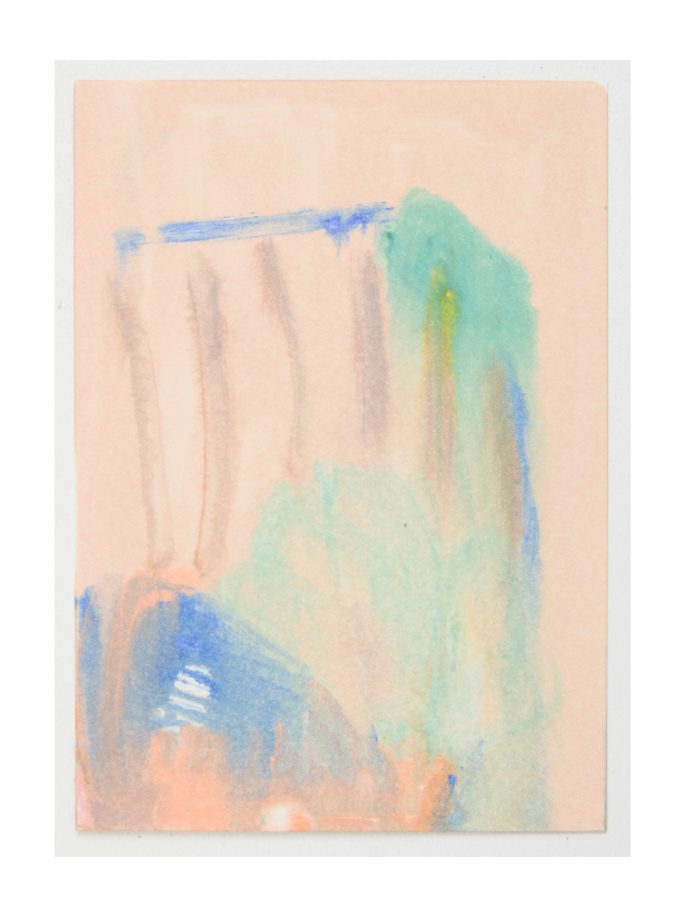
Emily Rae Smith Labuschagne Shape Series 7, 2023 Oil monotype on paper 14.8 x 10.5 cm R1 802 (inc VAT)