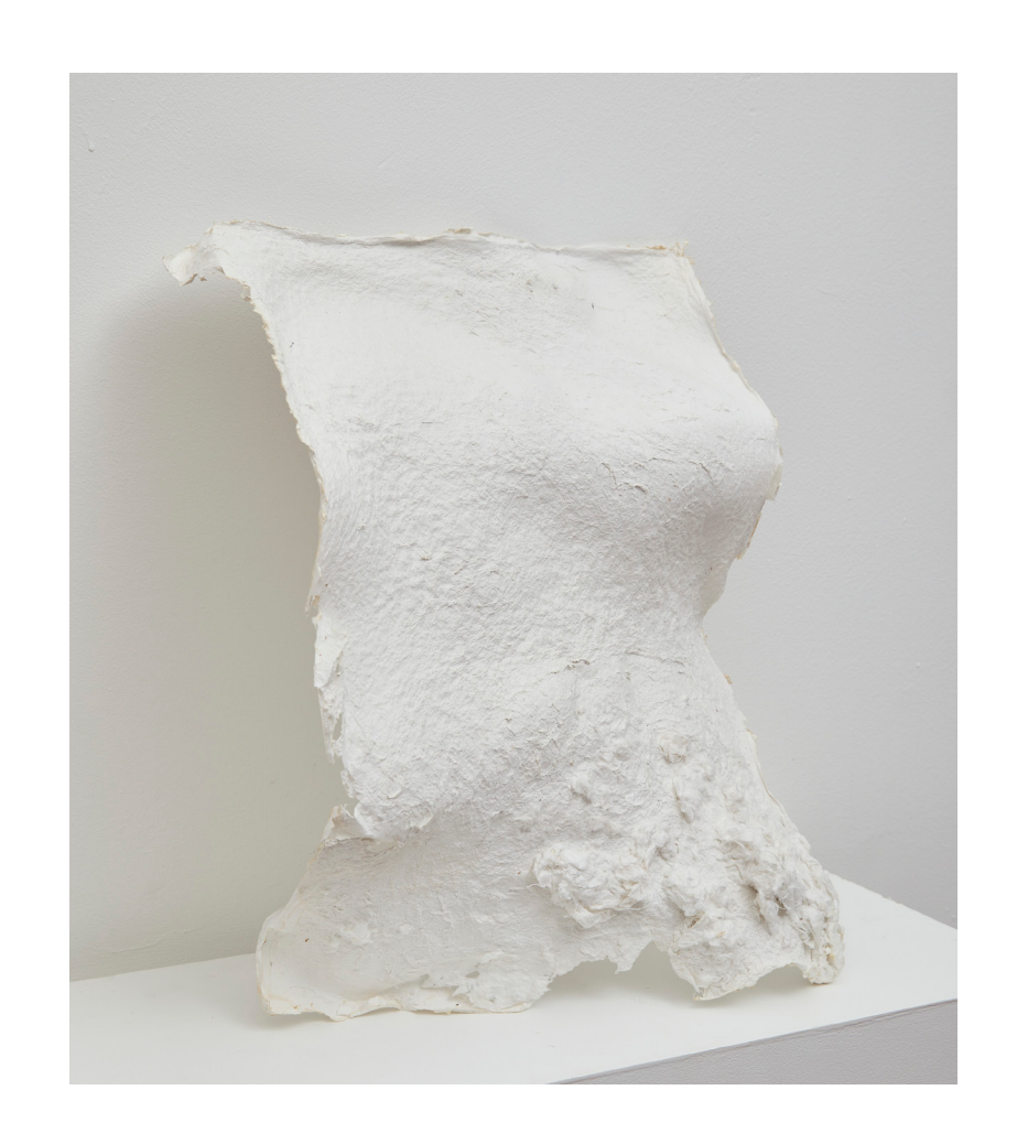
Gina van der Ploeg Pulp Sheet, 2023 Pure linen and cotton paper pulp 52 x 42 x 12 cm R10 600 (inc VAT)