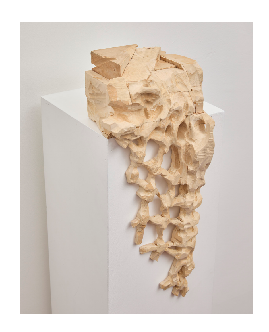
Daniel Tucker Collecting Dust, 2024 Found Objects and Jelutong 62 x 25 x 19cm R15 370 (inc VAT)