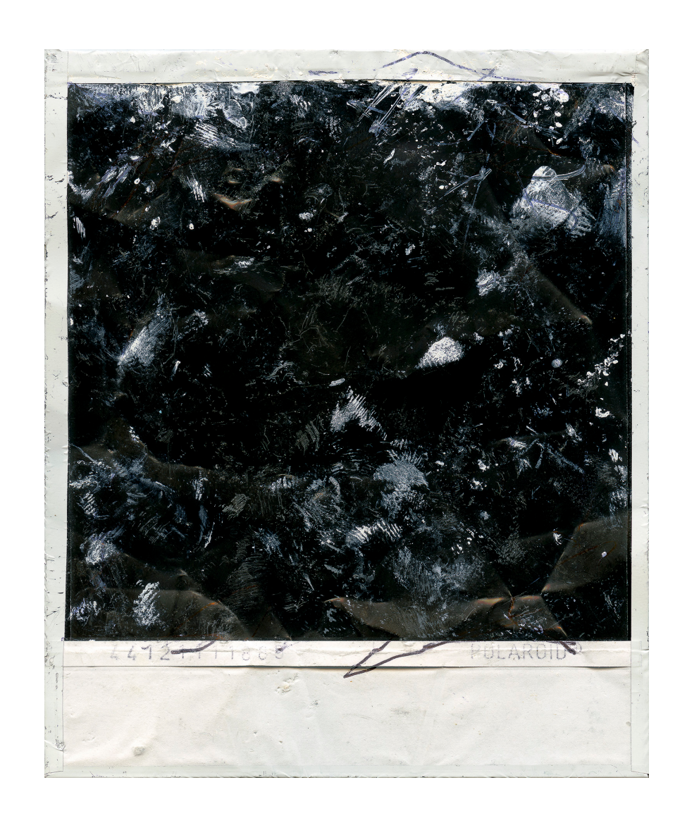
Dale Washkansky The Other Side, 2012 Lightjet photographic print 106 x 88 cm R7 950 (inc VAT)