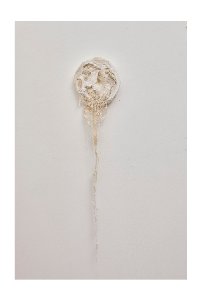
Kirstie Pietersen Doilie Cast V, 2024 Plaster of paris 89 x 21 x 4 cm R3 180 (inc VAT)