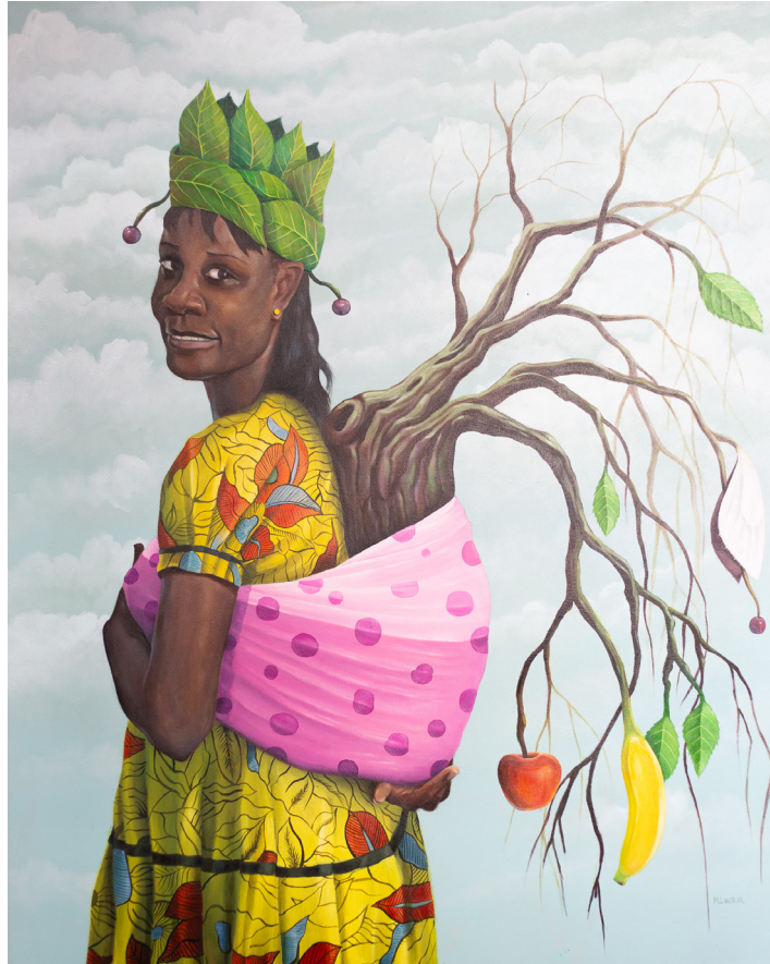
Many Libuta Olivia , 2023 Acrylic on Canvas 150 x 120 cm R33 920 (inc VAT)