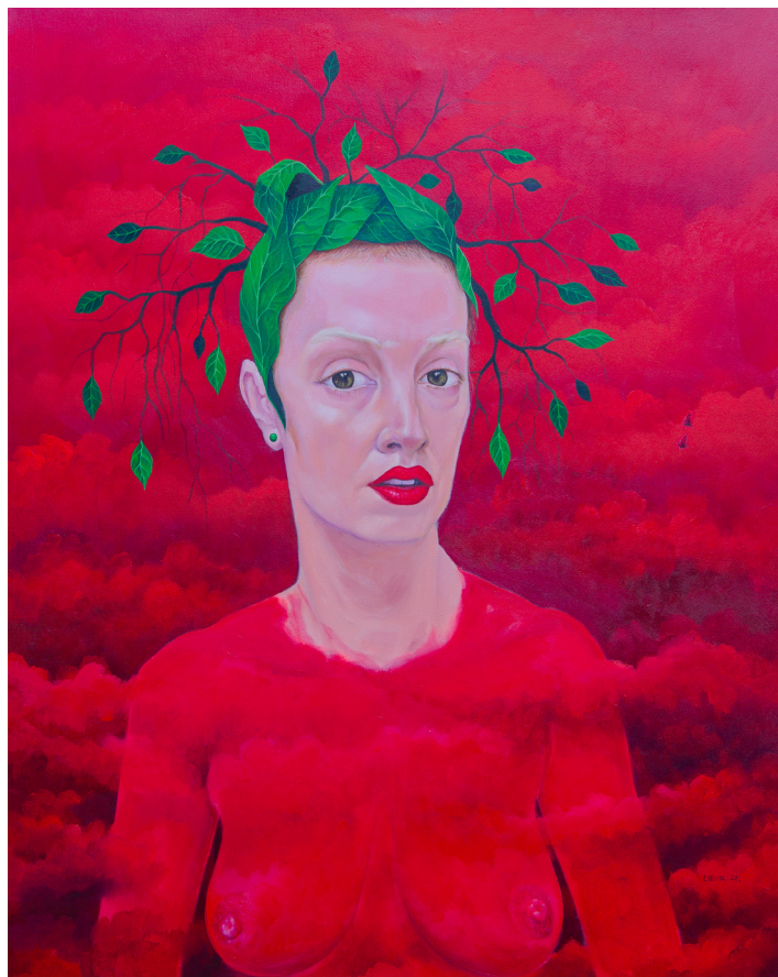
Many Libuta Fulguta , 2023 Acrylic on Canvas 150 x120 cm R33 920 (inc VAT)