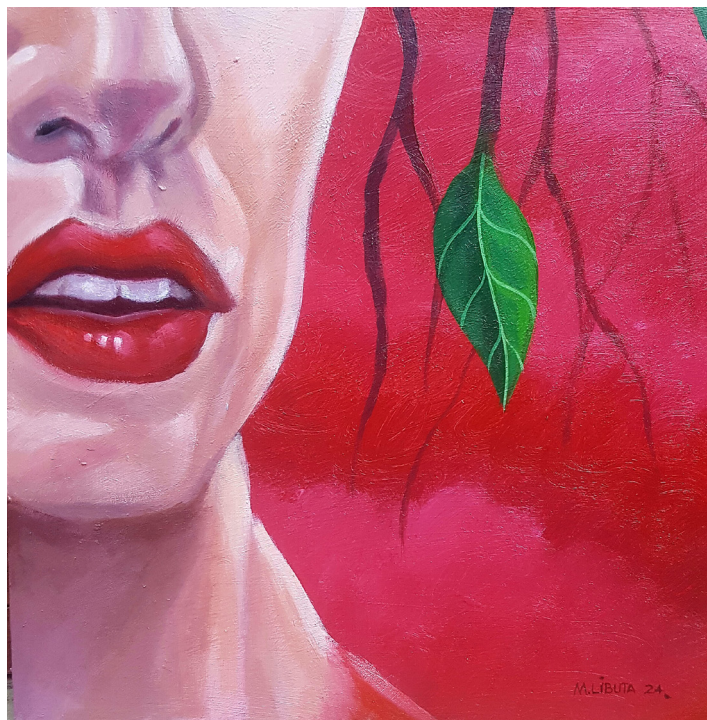
Many Libuta Red Lipstick, 2024 Acrylic on Board 30 x 30 cm R4 770 (inc VAT)