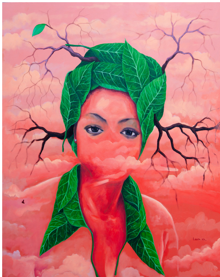
Many Libuta Patty , 2023 Acrylic on Canvas 150 x 120 cm R33 920 (inc VAT)