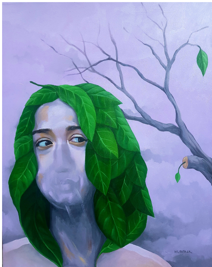
Many Libuta Elikia, 2024 Acrylic on Canvas 120 x90 cm R23 320 (inc VAT)