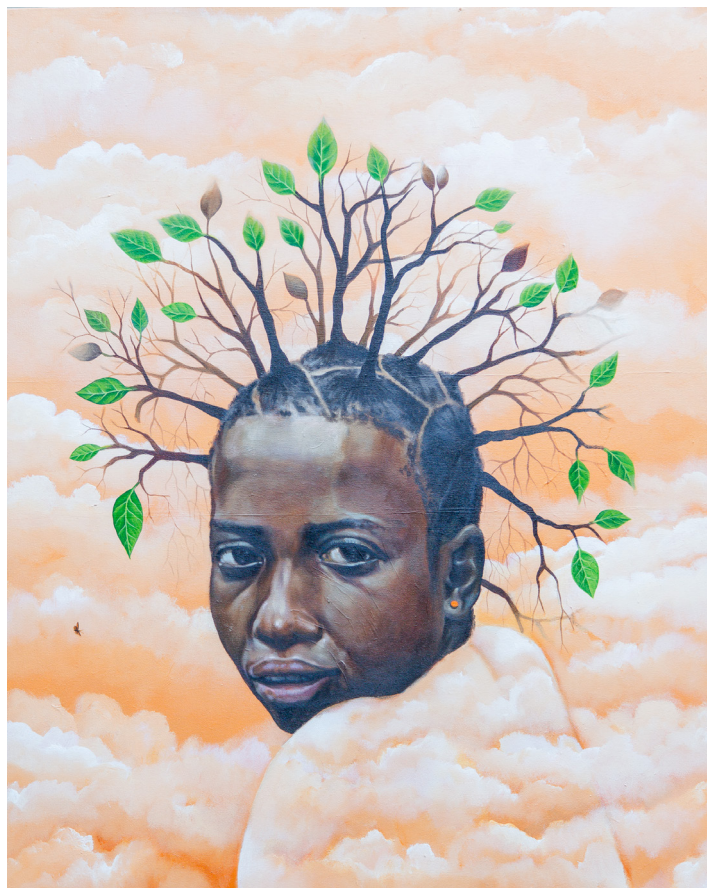
Many Libuta Rebecca, 2023 Acrylic on Canvas 120 x 90 cm R23 320 (inc VAT)