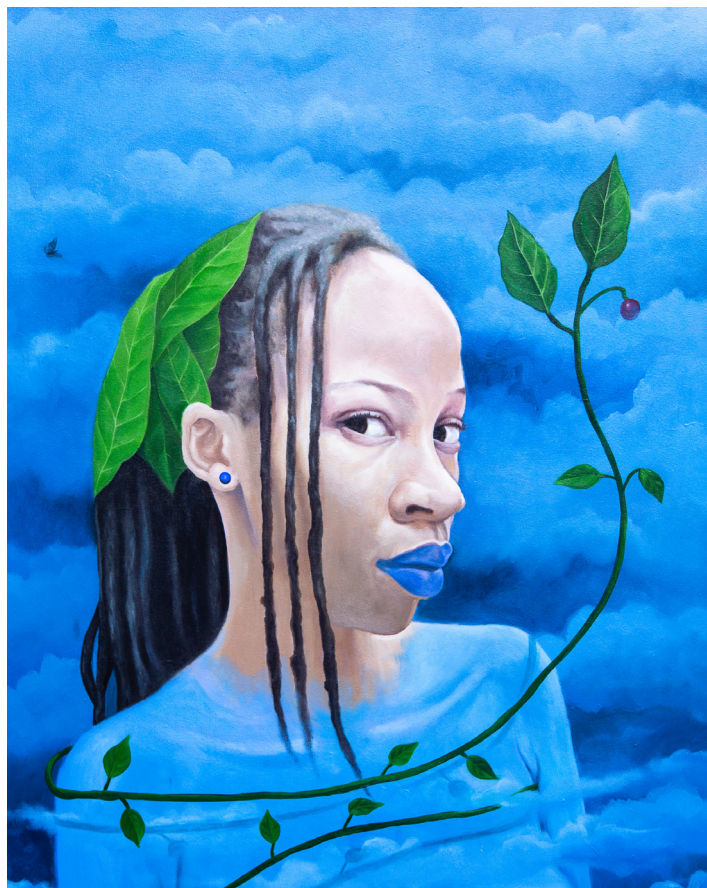
Many Libuta Nkoe , 2023 Acrylic on Canvas 120 x 90 cm R23 320 (inc VAT)