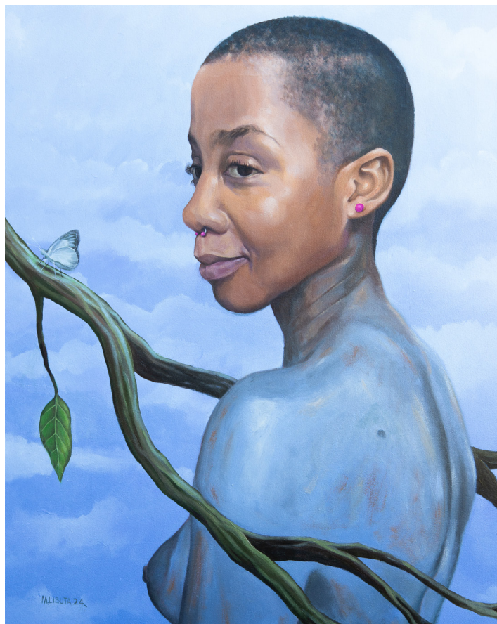
Many Libuta Botha Without Lipstick, 2024 Acrylic on Canvas 120 x 90 cm R23 320 (inc VAT)